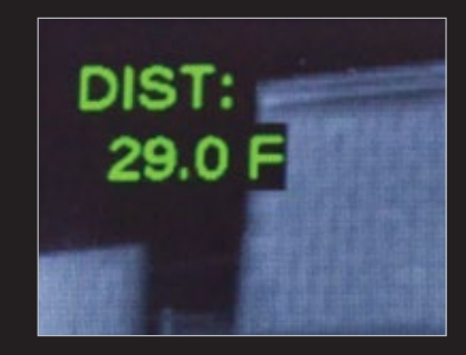
Laser Range Finder