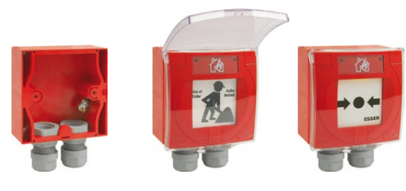
Cable gland optional