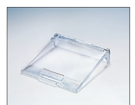
HINGED COVER (Pack 20) CP500/550/C