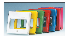
RANGE OF CASING COLOURS White, Yellow, Green, Red, Blue