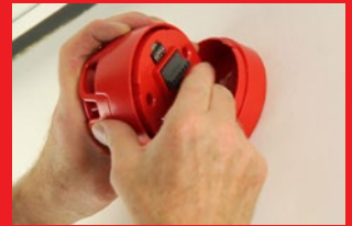
Easy first fix via snap on terminal block