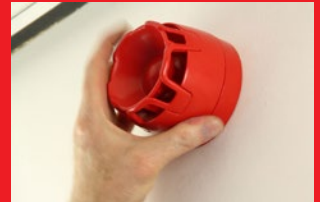
Maximum quarter turn for product engagement