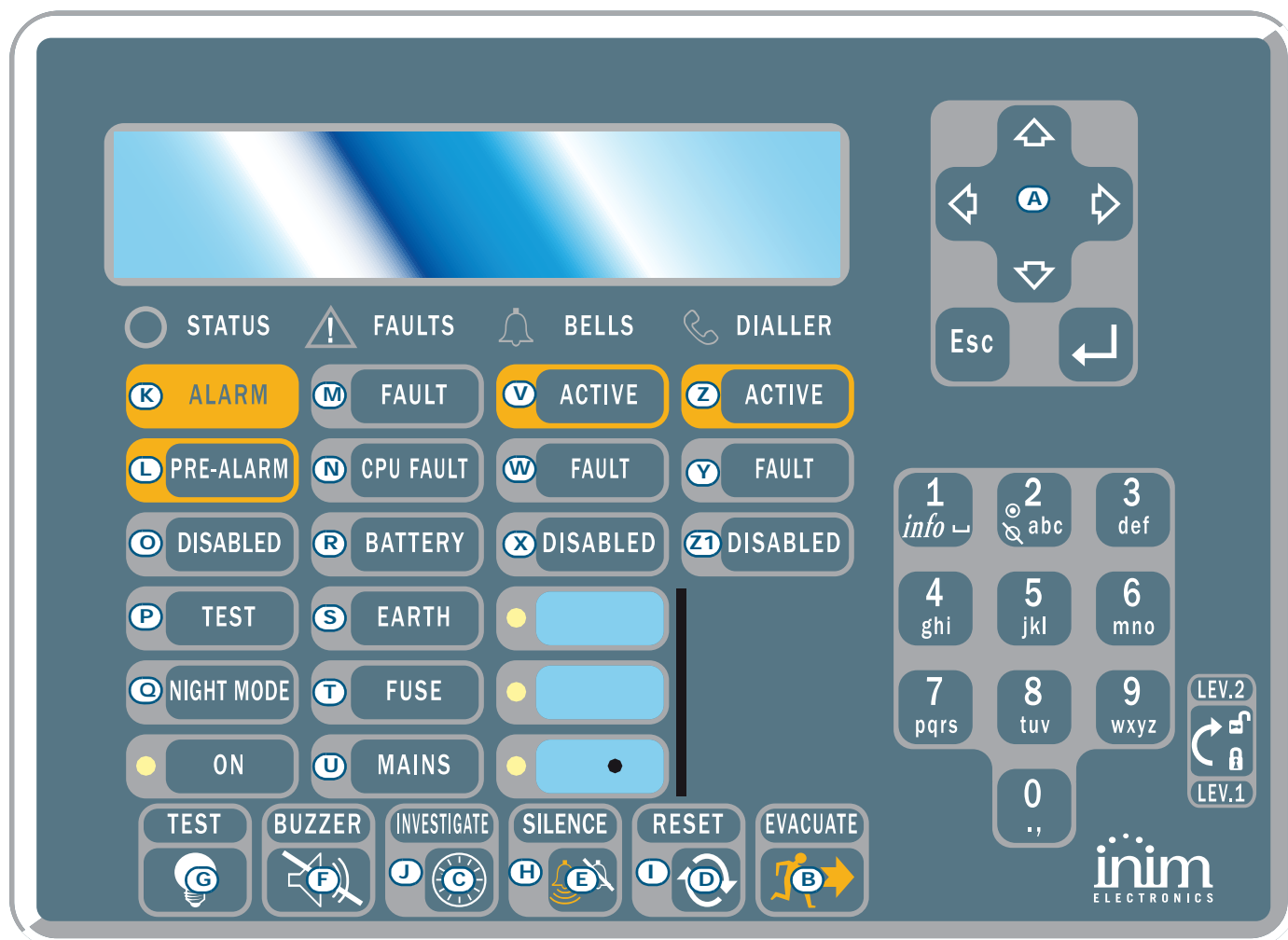
Figure 2 - Front view of the repeater panel

Connected repeater panels replicate all the information provided by the control panel and allow access to all Level 1 and 2 functions (View active events, Reset, Silence, etc.), but do not allow access to the Main menu.