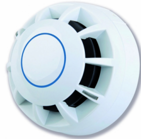
Illustration shows a CA414 CAST multisensor detector mounted on a CA408 base. The multisensor has a blue colour coded ring.

The detector must be fitted to either a CA408 CAST detector base (which has an integrated locking mechanism to prevent tampering), or a CAST Base Mount device (Part Nos. CA431A/W, CA432A/W, CA456A/W, CA459A/W, CA460A/W). Refer to CA408 Document No. DFU0002408 for detector wiring and fitting details.