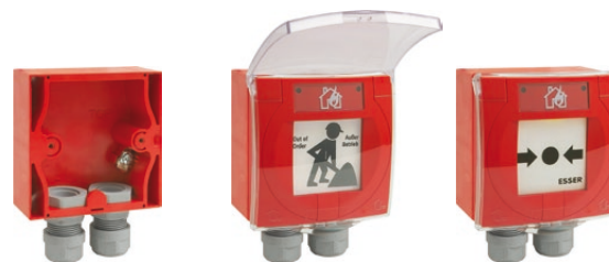
Cable gland optional