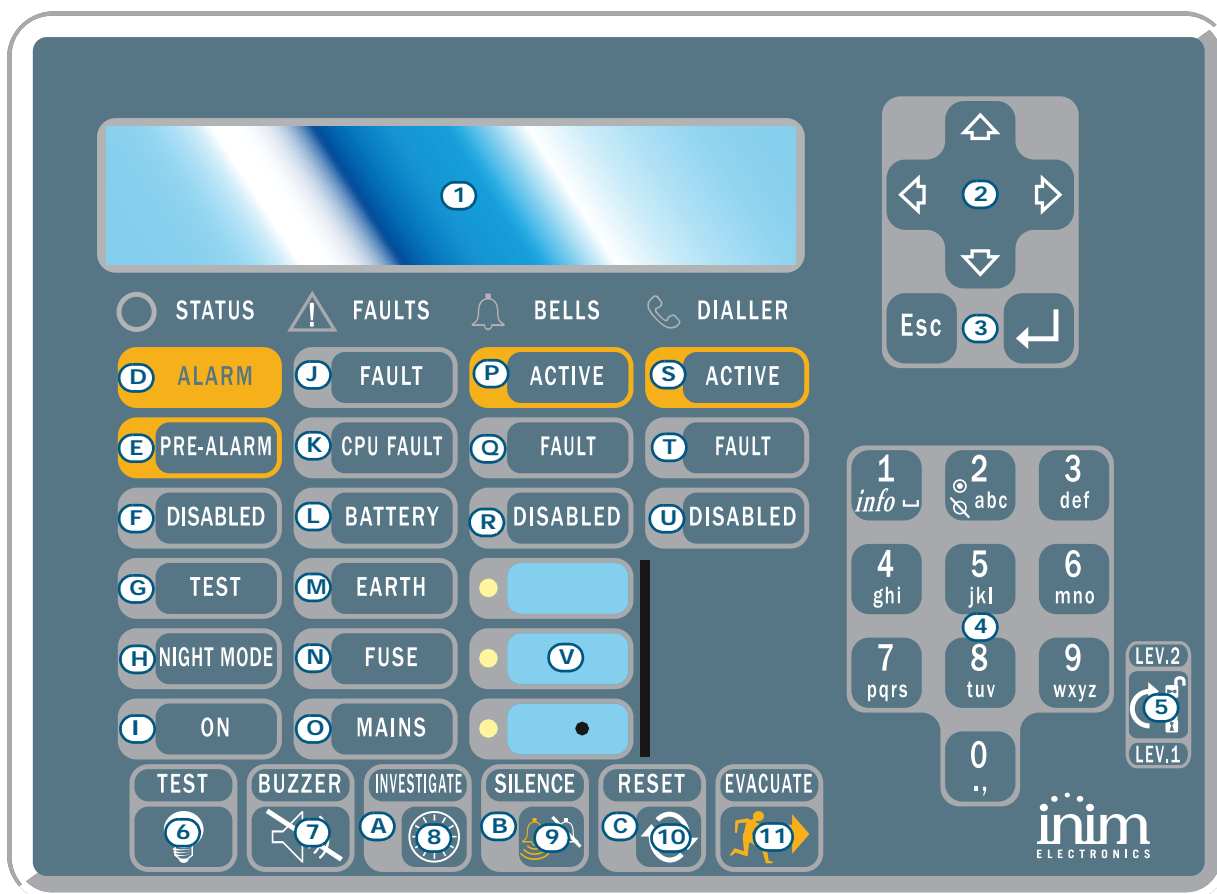
Figure 1 - Control panel frontplate

The SmartLoop control panel manages up to 15 consoles, the main console is located on the control panel frontplate (“/G” and “/P” models only), and up to 14 optional consoles (SmartLetUSee/LCD repeaters connectable to RS485 BUS).