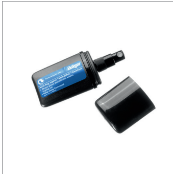
Anti-fogging Spray (15 ml)