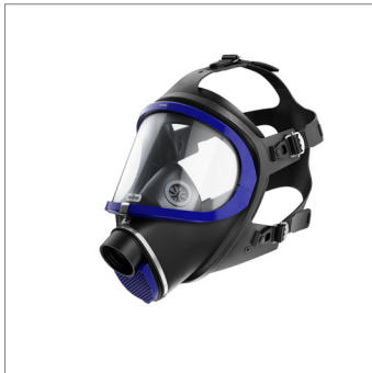
Dräger X-plore 6300

The Dräger X-plore 6300 is the efficient yet low-cost full face mask intended for price-conscious users not wishing to compromise on comfort or quality. This full face mask is the successor to the Panorama Nova Standard, a mask which has proven itself over decades of use worldwide – redesigned and improved with fresh colours and an integrated barcode.