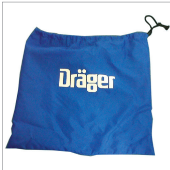
Full Face Bag