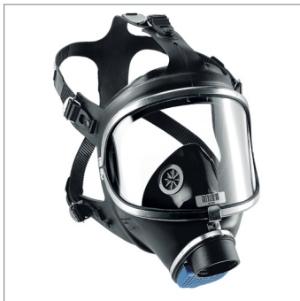
Dräger X-plore 6530

The full face mask Dräger X-plore 6530 is the successor to the Panorama Nova RA masks, meeting the highest demands for quality, reliability and secure fit. The mask body made from EPDM is highly resistant and skin-friendly, offering high wearing comfort.