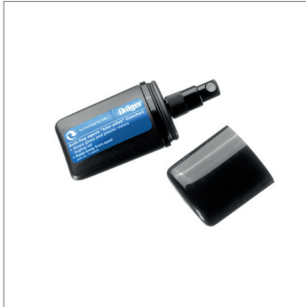
Anti-fogging spray (15 ml)