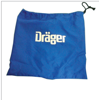
Full Face Bag